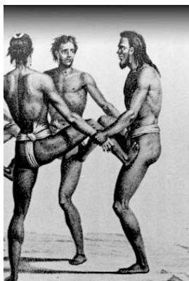
Chamorro natives of the Marianas (now Guam)