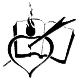
Seal of the Augustinian Order

to seek some place of retirement so that with greater ease and freedom he could [serve] God our Lord under obedience to someone to whom in place of God he would subject his will. For this purpose he went to offer himself to the Fathers of St. Augustine, as being the one he knew best, since they are the ministers of his Pampango nation, to serve them out of love for God in whatever they might wish to occupy him. Recognizing the good