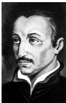
Fr. Diego Luis de Sanvitores

Nor did he show less solicitude in mortifying himself in some things which he could licitly do. An example of such was his not going out of his room unless it was for some good purpose, nor looking at some curious thing, if there should be any such in the Marianas, nor ask nor want to know what was not of concern.